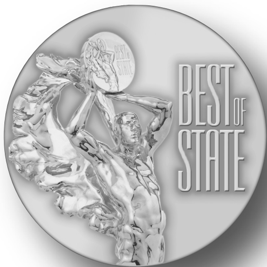
2007 Utah BEST of STATE Awards Inventor of the Year