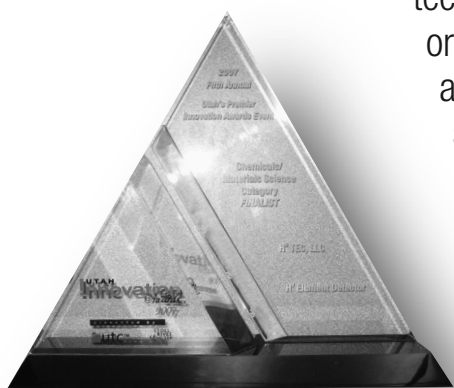
2007 Utah Innovation Awards Finalist, Chemical Materials